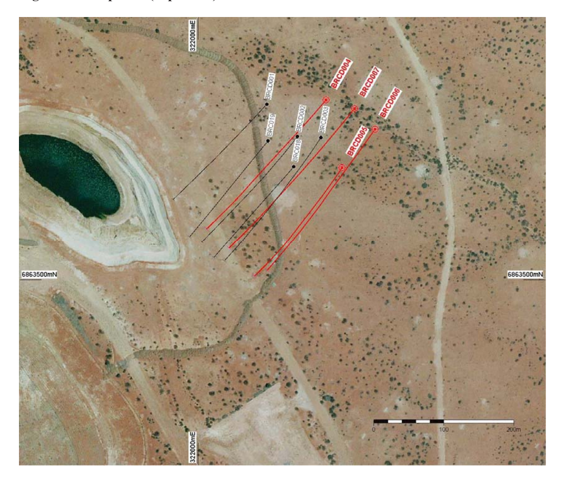
Figure 2: Completed (Sept 2018) RC/Diamond Drill Hole Location Plan

Jamie Sullivan Executive Director 12 October 2018