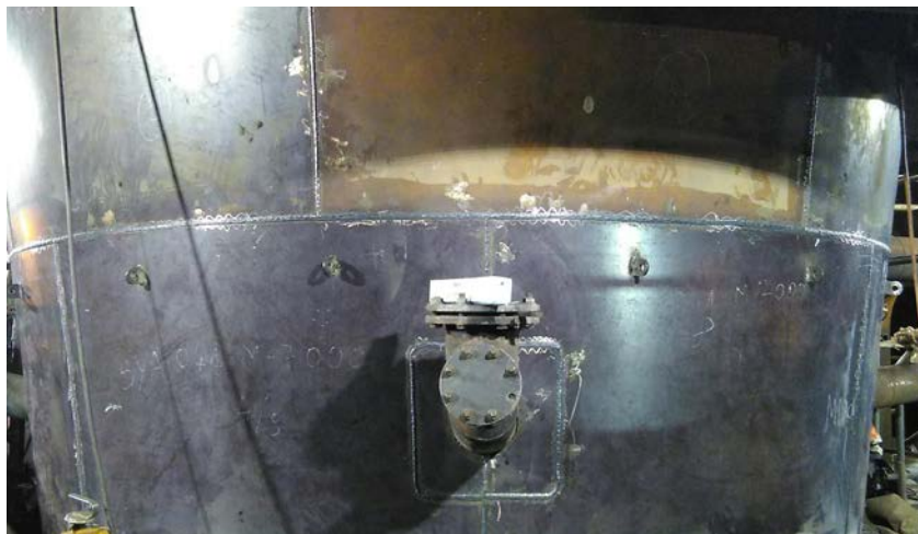
Figure 3: Photo showing progress of repairs to the Roaster. New plates have been welded to form a shell around the damaged area of the Roaster as depicted in Figure 2