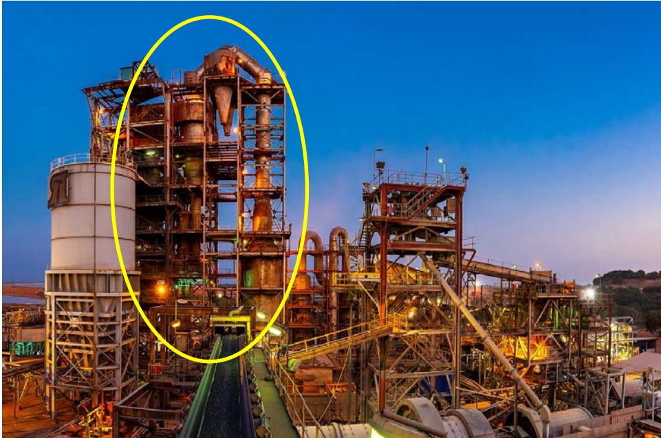
Figure 1: Syama Processing Plant highlighting the Sulphide Roaster

The impact of the roaster repairs will affect unit costs for the Syama sulphide circuit. Any impact on Resolute FY19 cost guidance will be disclosed in the Company's September Quarterly Activities Report which is expected to be released on 31 October 2019.