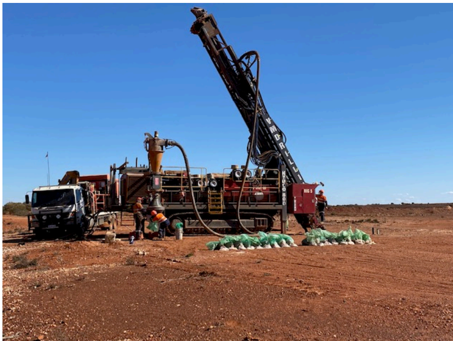
Figure 1: RC Drilling Rig on site at Gum Creek Gold Project

"It is great to be drilling again at the Gum Creek Gold Project, with the initial program targeting the high-grade Swan and Swift deposits. This marks the start of a new phase of exploration for the Company in this highly prospective belt. Along with our comprehensive review of previous geological data, which is well underway, we look forward to planning a more expansive drill program leading into 2021".