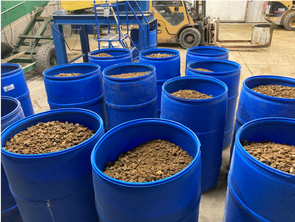
Figure 1: Crushed and blended ore from the NiWest Project prior to leaching and refining